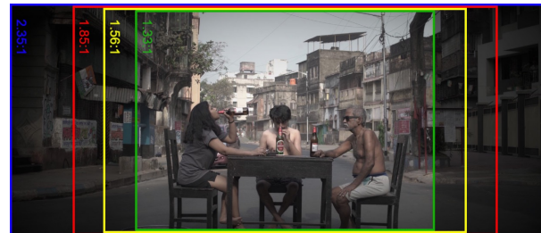
Different pan shots

a pan shot is a horizontal camera movement in which the camera pivots left or right while its base remains in a fixed location