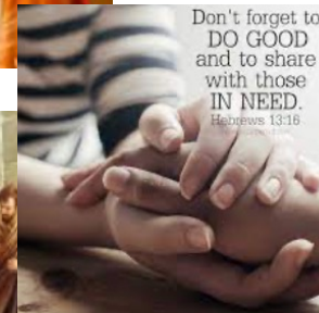
Don't forget to DO GOOD and to share with those IN NEED. Hebrews 13:16