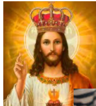
What are the qualities of king?