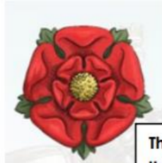
The red rose was the badge of the Lancastrians