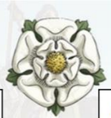
The white rose was the badge of the Yorkists