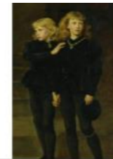
The Princes in the Tower