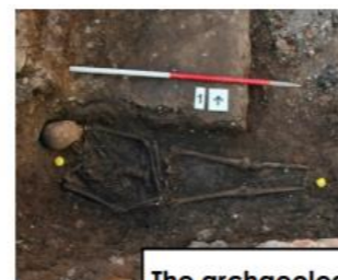
The archaeological dig, Leicester