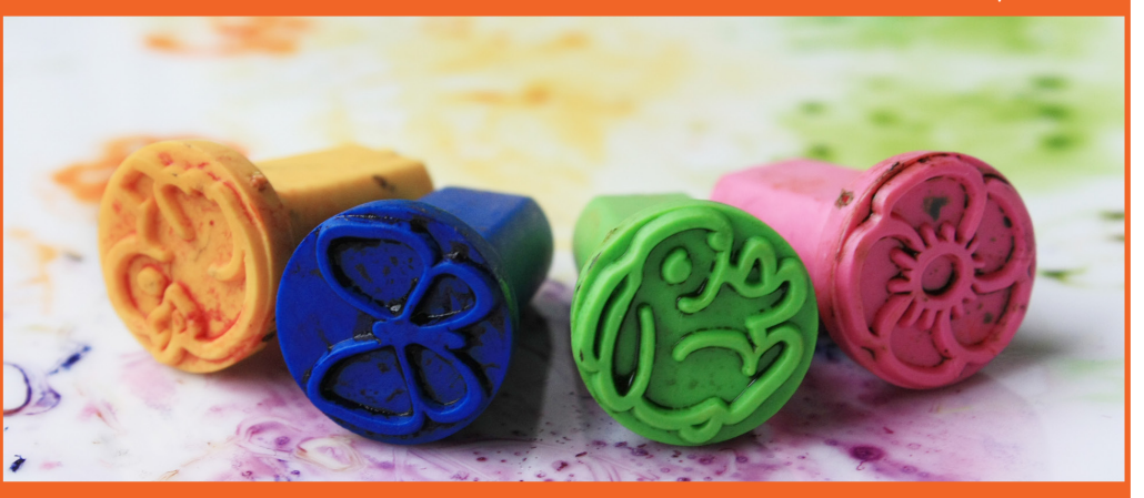
Mark making is the creation of different patterns, lines, textures and shapes